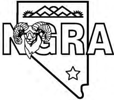
Exhibit 10: Royalty Personal Financial Responsibility Agreement